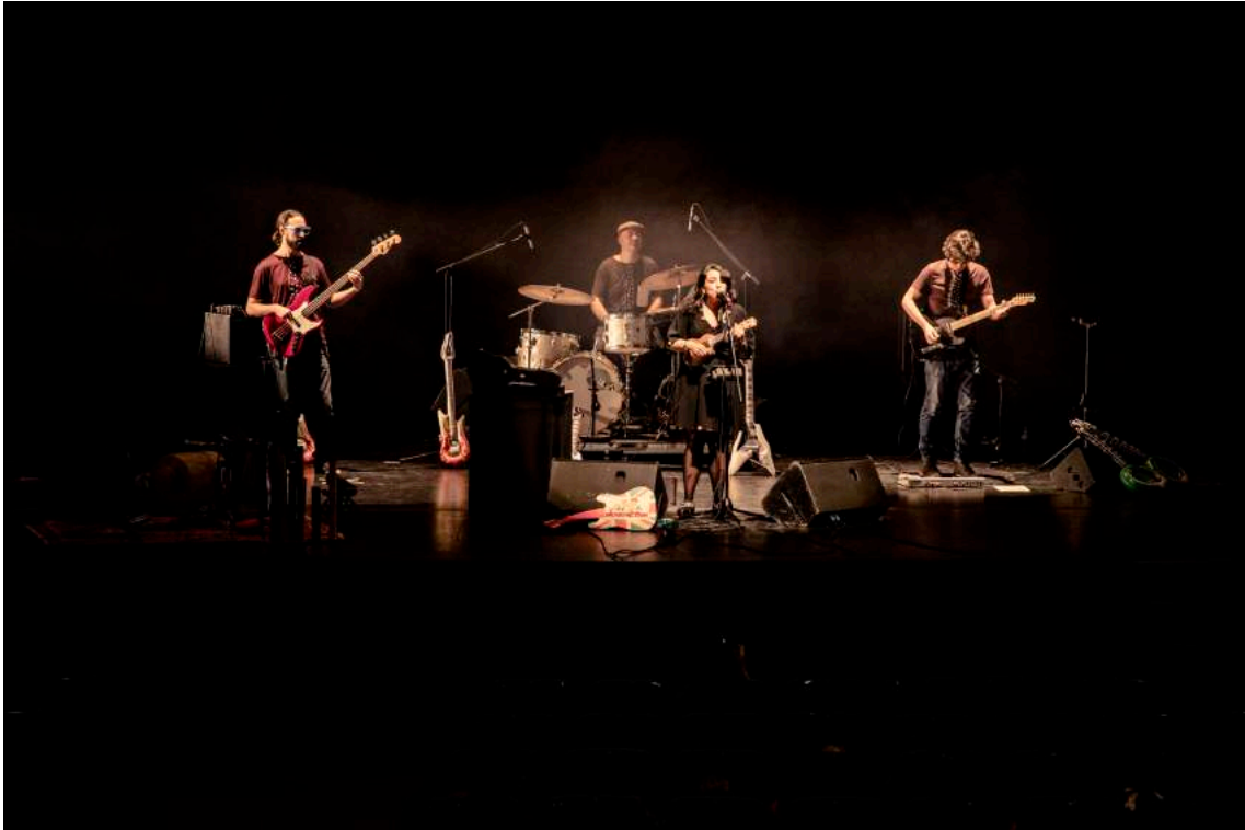
Music In Action in front of 600 students