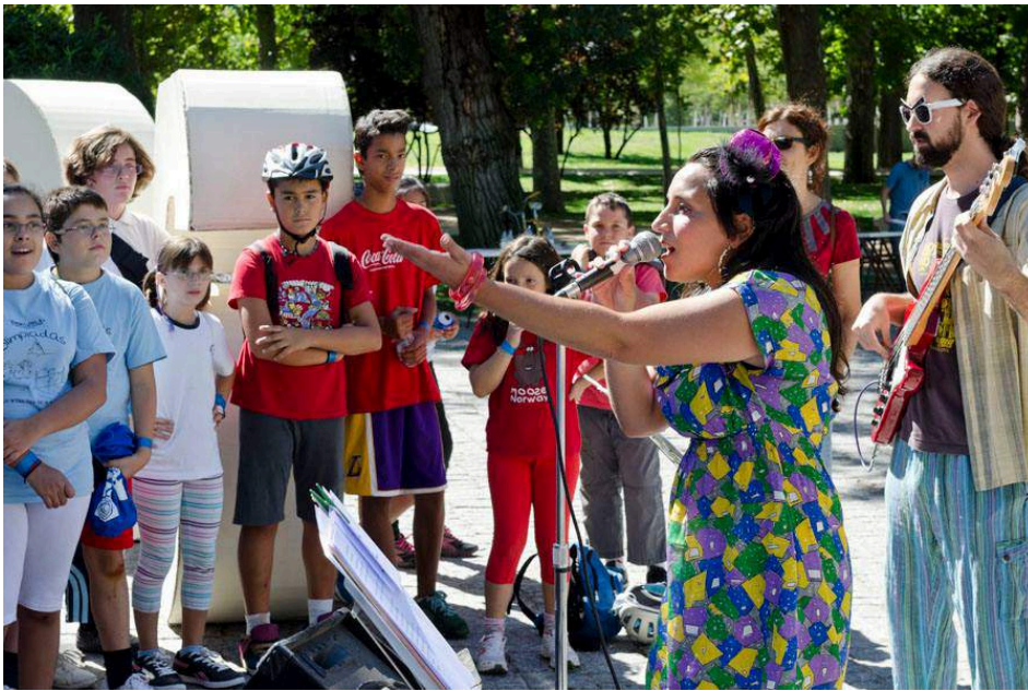
Music In Action live during the bike campaign "Bike to school is cool" STARS (sept 2013)