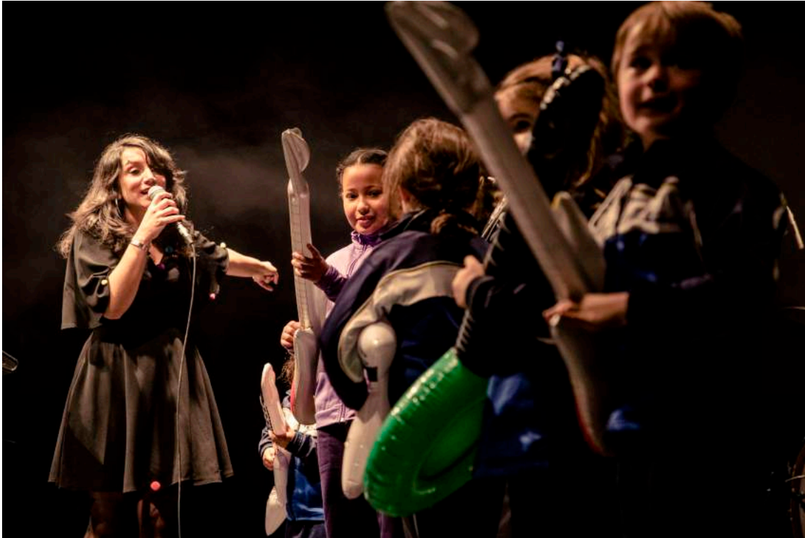
Kids rocking on stage Teatro Auditorio Alcobendas March 2017.

Overall, a Music In Action concert is a perfect activity to reinforce language and meaning as well as making students sing and participate in a real rock show with a live band.