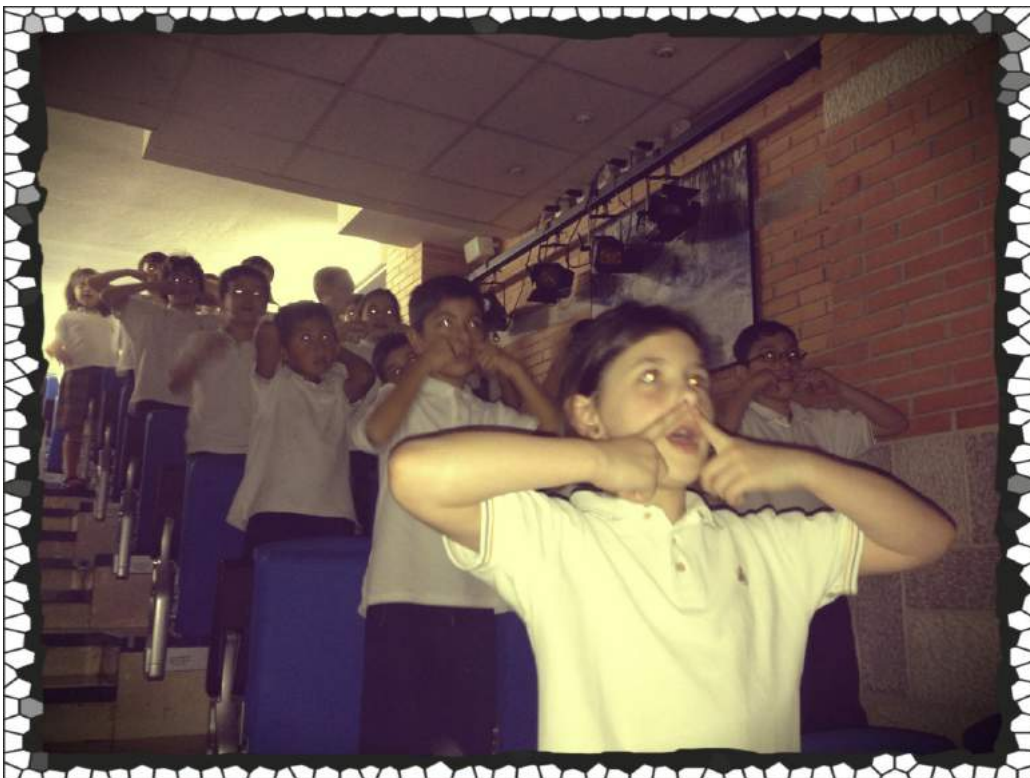
Gredos San Diego School Vallecas 2014